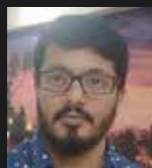
Patnana Sayesu India

I had attended Info Sec's CCSP training course, and Infosec Train was really Training Center in explaining the concepts Of each CCSP domain and the type Of questions we can expect